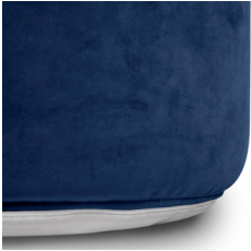
Handy non-slip bottom